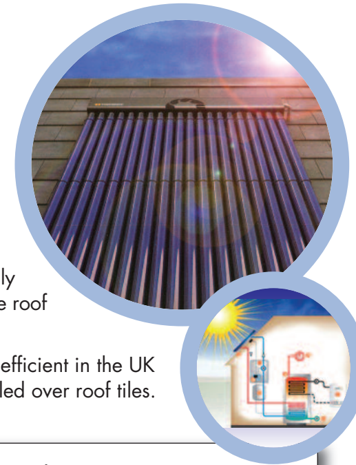
Typical solar hot water generation over a year (average of 70%)

Evacuated vacuum tubes are very efficient in the UK climate but they can only be installed over roof tiles.